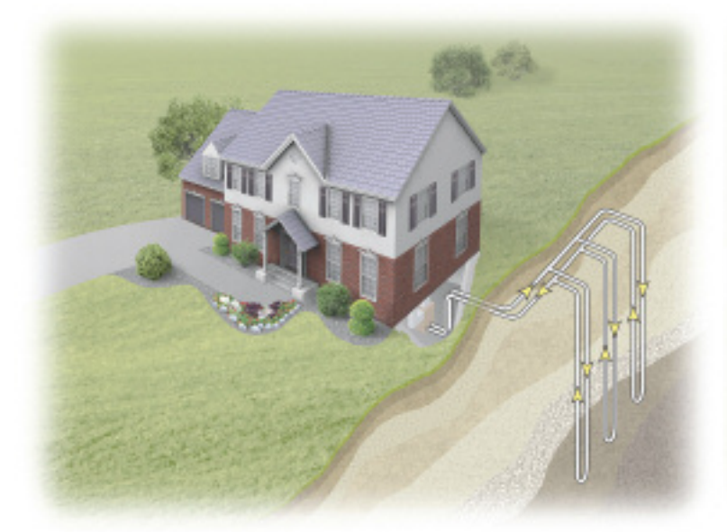
Vertical Loops: Used where land area is limited or soil conditions prohibit horizontal loops. Installed using a drilling rig.