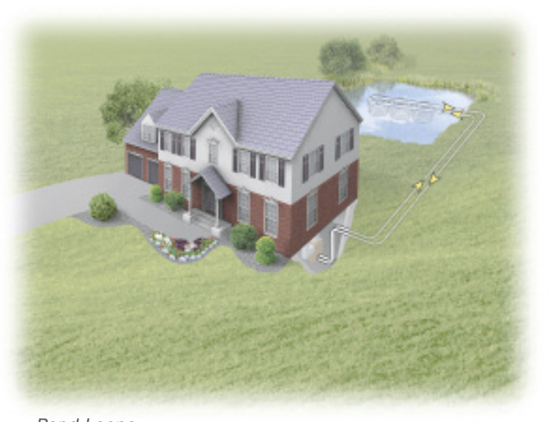
Pond Loops: Coils of pipe are connected and sunk to the bottom of the pond.