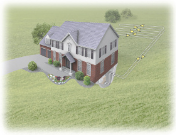
Horizontal Loops: Used on larger lots. Installed using a backhoe or trencher.

On a grander scale, imagine the impact of the reduced emissions resulting from every current geothermal comfort system installation today. The collective result would be a dramatic reduction in carbon footprint.