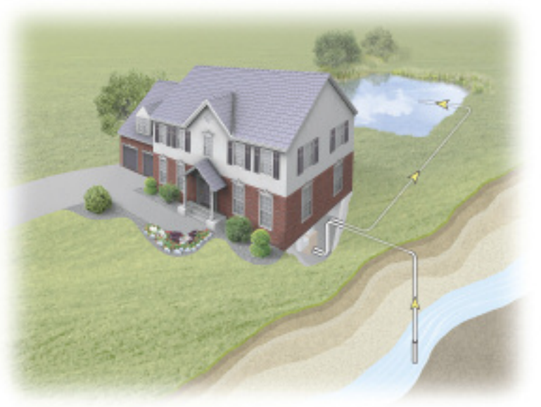
Open Loop: Well water from an existing well can be used, then discharged into a drainage ditch or pond.